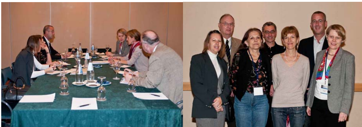
EURBICA Board during its meeting in Malta (November 16, 2009)

EURBICA Executive Board's two meetings in 2009 (in Malta) and 2010 (in Oslo) have resulted in several important decisions. A new statutes of EURBICA was prepared and it was disseminated to all members for discussion and for the possible proposals for its modification. Currently it is also available on ICA web page. In the frame of budget information it is important that EURBICA supported the 8 th European Conference on Digital Archiving in Geneva 2010 (ACE) with the whole regular funds for 2009 and 2010 – since EURBICA was also co-organizer with ICA/SPA.