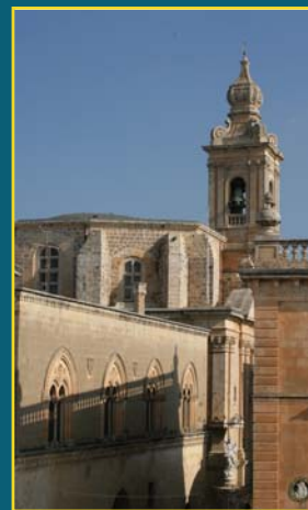
View of Carmelite Church from the Legal Documentation Section, Mdina (KEVIN CASHA)

The draft program of CITRA 2009 will be available soon online.