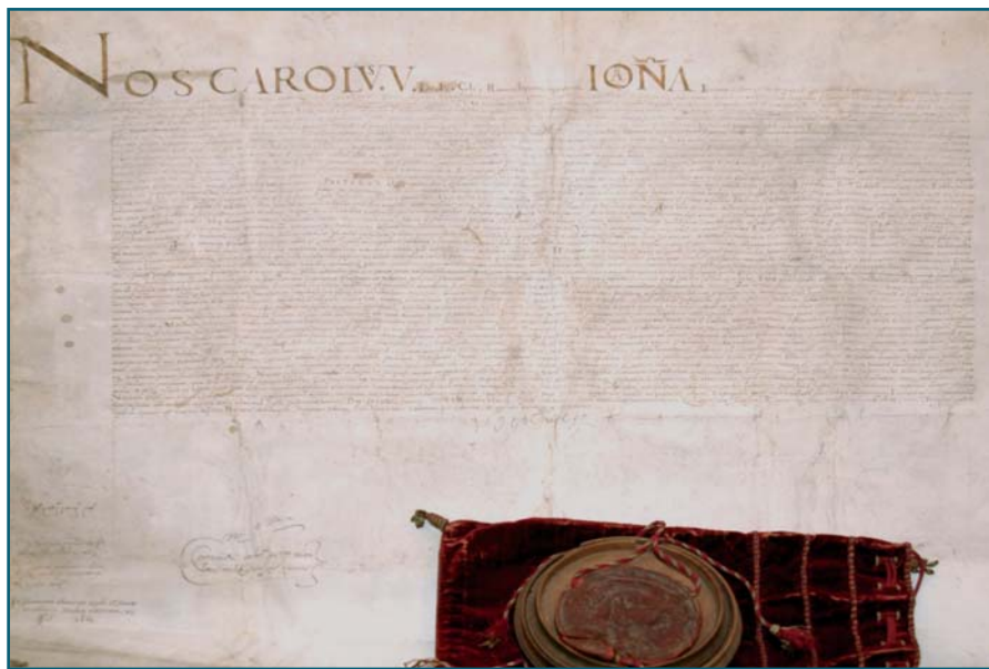
The Donation of Malta to the Knights by Charles V

Archives provide the bedrock for our understanding of the past. They show us and future generations, how we came to be what we are as a nation, a community or an individual. They are a hidden national asset and constitute the very essence of our heritage. Malta is rich in archival holdings with Maltese notaries practising their profession and thus creating archival records way back into the 15 th century. Archives in Malta are administered under different authorities and governing bodies, depending on whether they are public, ecclesiastical, or private.